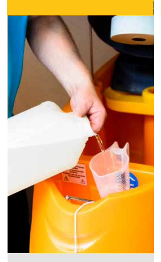
Measure the quantity of the cleaning product 50 ml product per 10 L water (1:200)