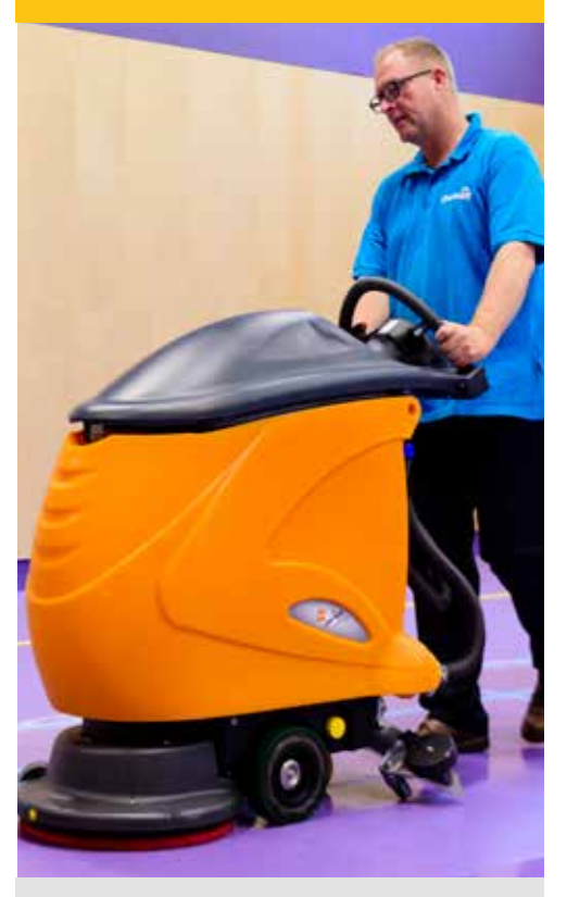
Apply the fluid while scrubbing and let the machine suck it up immediately. Work at a normal walking pace.