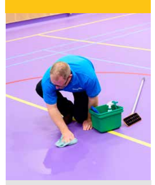
Wipe the spot dry with a microfibre cloth. If necessary, repeat steps 1 to 3.