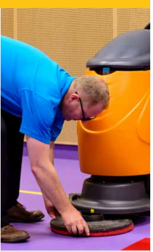
Attach the red pad underneath the scrubbing/suction machine.