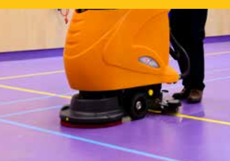
Let the machine suck up the fluid while scrubbing. Work at a slow walking pace.